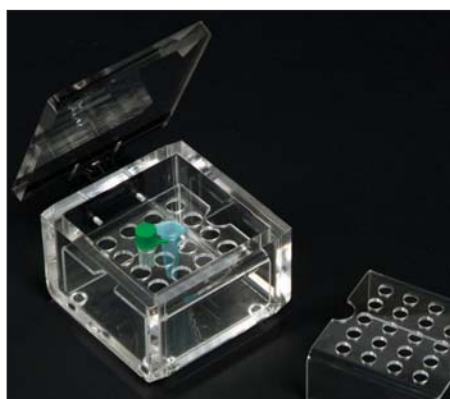
RA612-15 in use with accessories