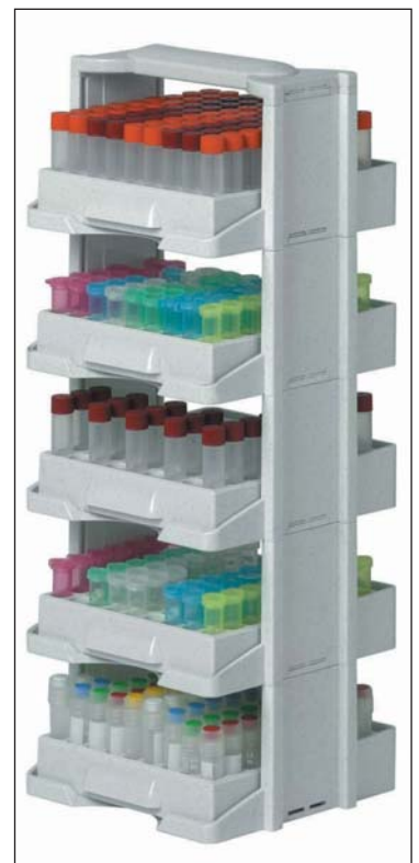
TP468 in use