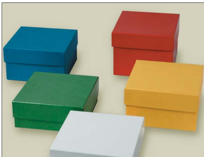
TP458-02 to TP458-50 boxes