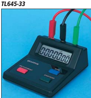
TL648-22 in use