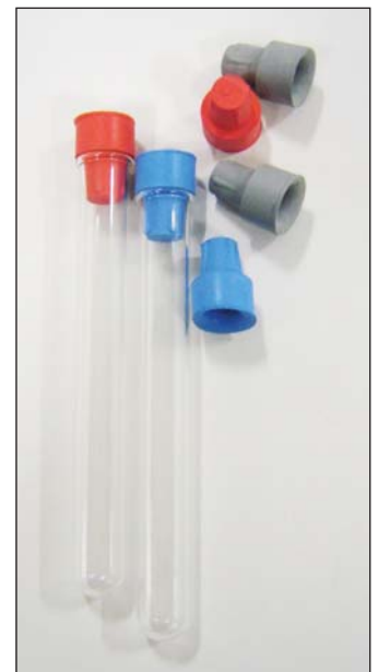
TE885 in use