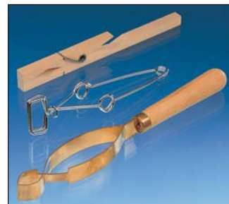
TE920-20 (top), TE920-30, -45