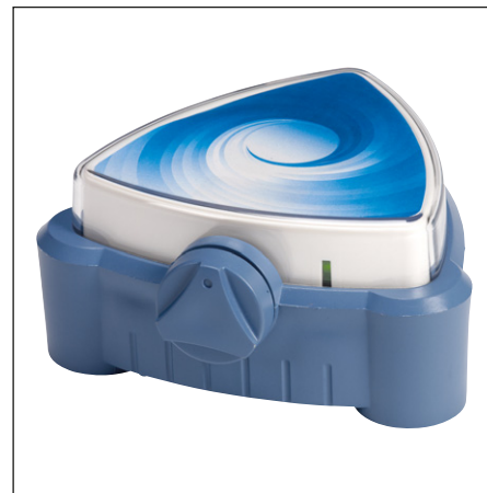
SS310-35, SS310-15 and -25 are similar