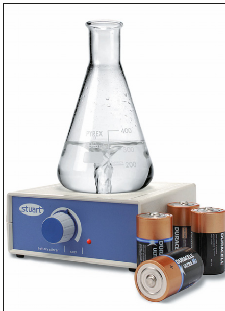
SS320-40 in use with accessories