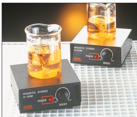
SS307-10 in use