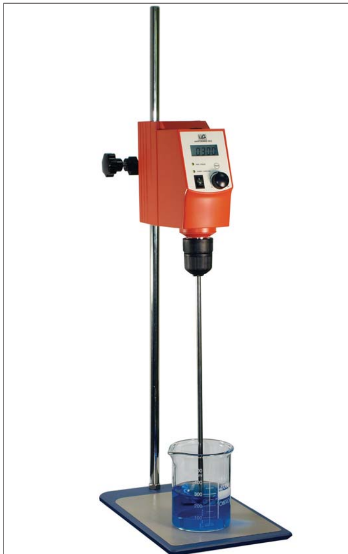
SR810-10 in use