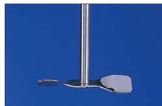
SR852-75, SR852-70 is similar