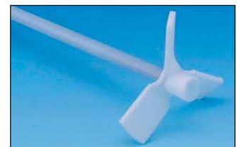
SR904, SR906 is similar