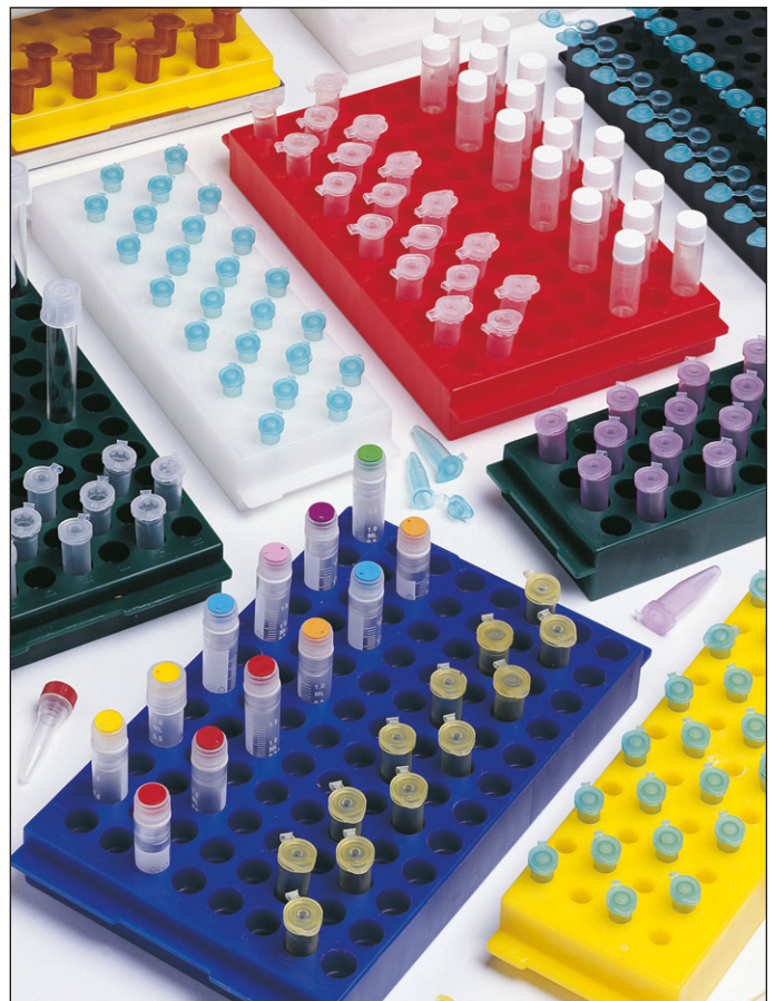
SM595, SM597 in use