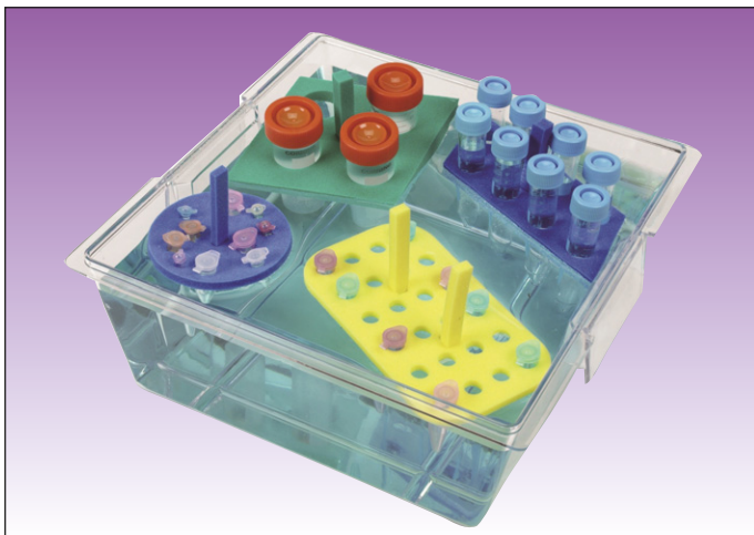
SM593 in use