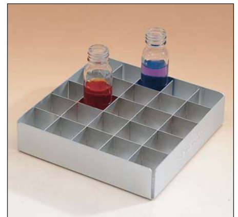
SM470 in use