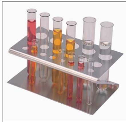
SM395 in use