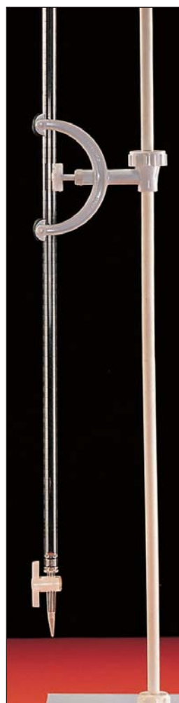
SL745-10 in use