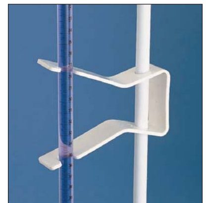
SL755 in use