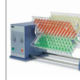
SE610-55 in use with SE610-57