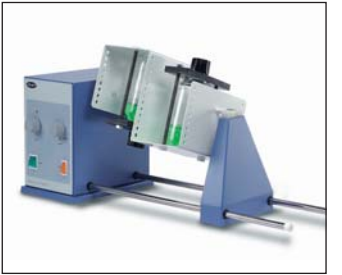
SE605-10 in use SE610-10 in use