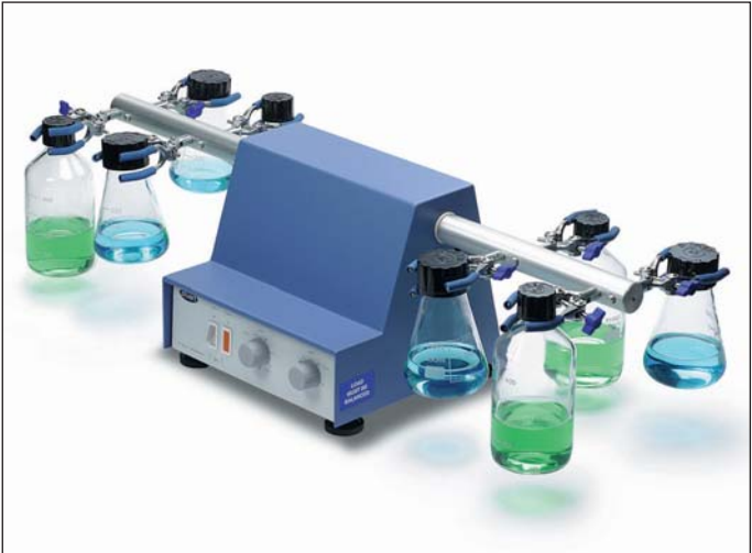
SE530 in use

SE610-55 Rack cradle STR4/5 SE610-57 Spare rack for SE610-55. Accepts up to 60 Eppendorf tubes