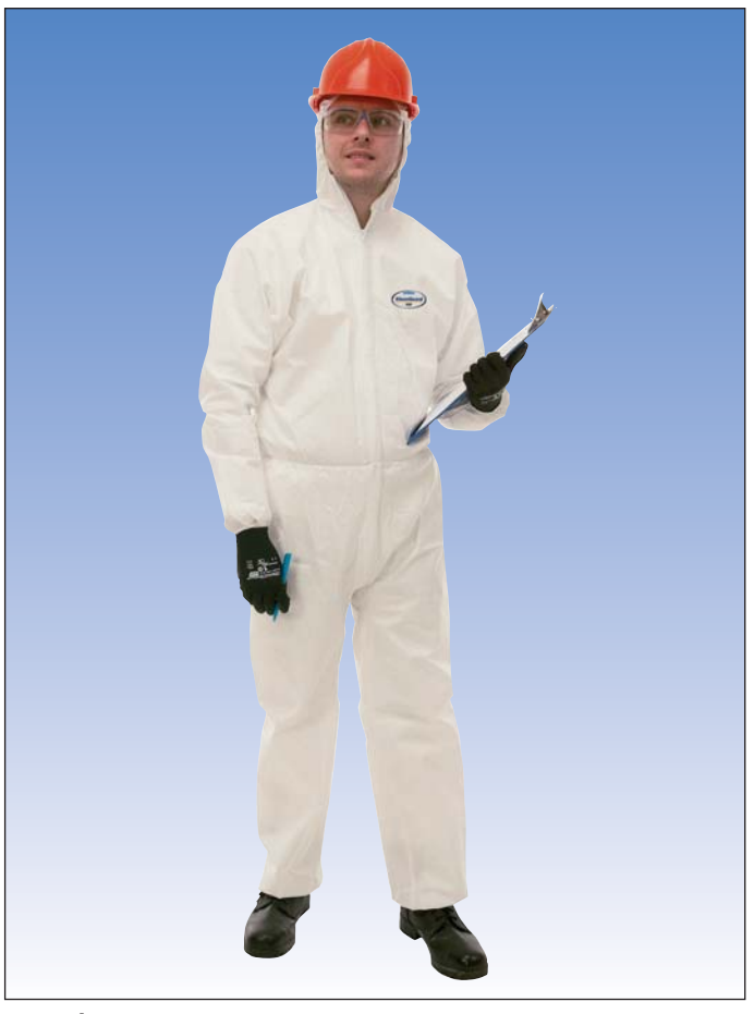
SA339 in use