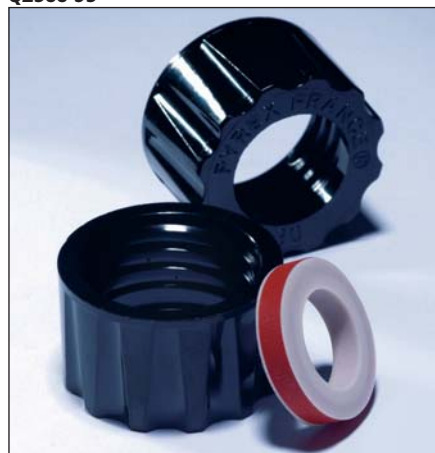
QZ701-41-44 with QZ701-19-56