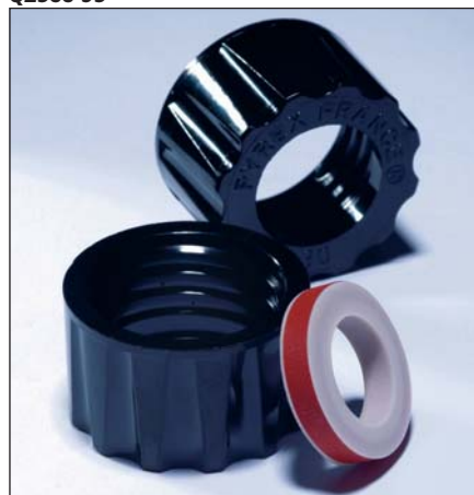
QZ701-41-44 with QZ701-19-56