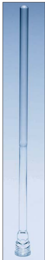
QZ588-32 to -34 QZ703