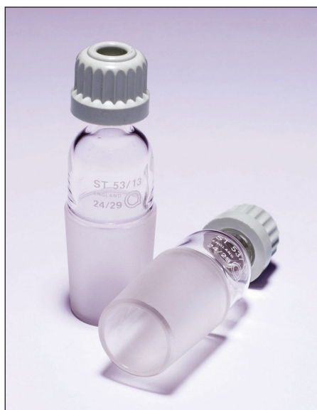
QST51, QST52, QST53