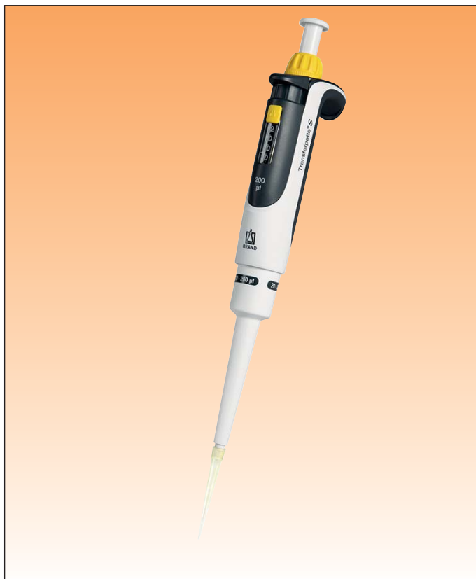
PR170, PR173 are similar

Provided the instrument is used with the recommended accessories and in accordance with the supplied instructions, Brand certify conformity with annex 12 of the Eichordnung.