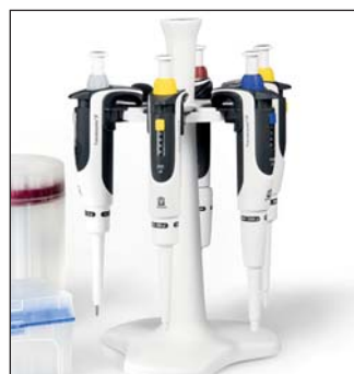
PR173-95 in use