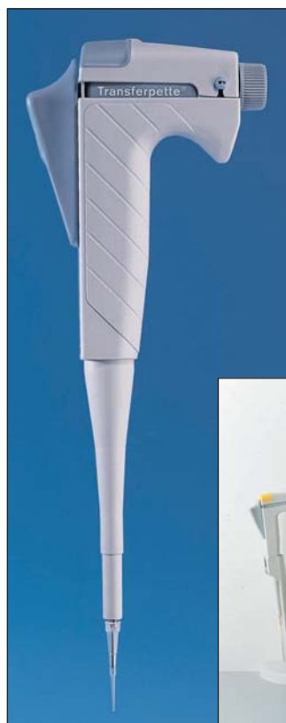
PR134, PR138 is similar with fixed volume