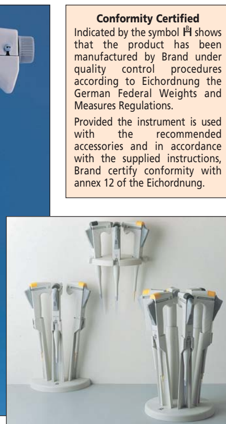
PR142-08 and PR142-10 with instruments