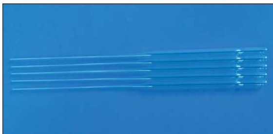
PP502, PP506/PP522 series are similar