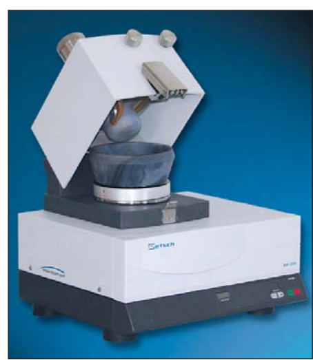
MX300 in use