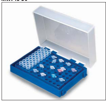
MW747-15 in use