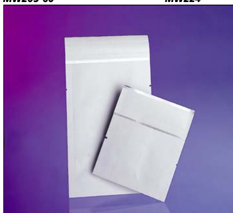
MW205-72 to MW205-79