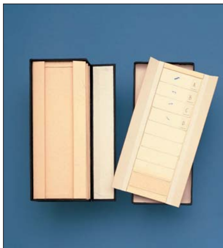
ML805 with ML807