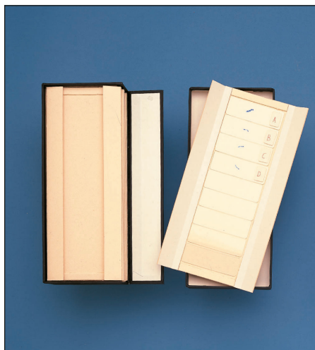
ML805 with ML807