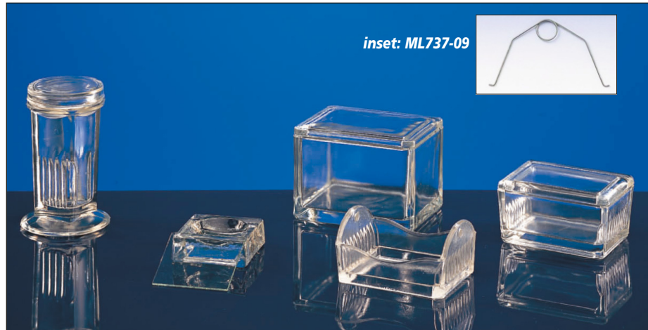
ML720-10, ML700, ML735, ML737, ML730