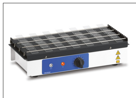
HG310 in use