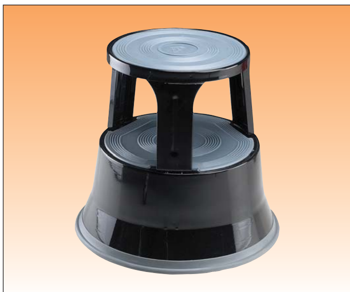
FZ680-45, FZ680-47 and -49 are similar