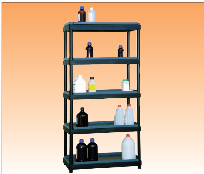
FZ685-10 in use