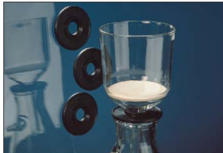
FK364-10 in use