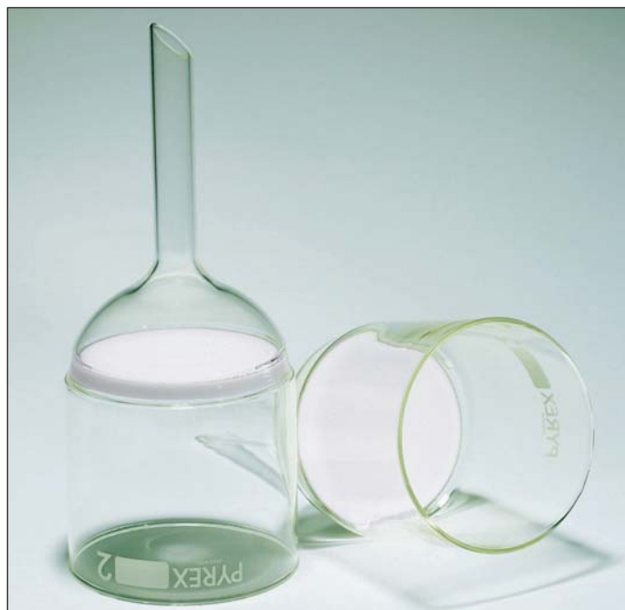
FT656/FT660, FT650/FT654 are similar