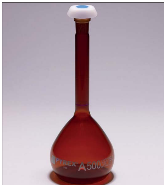
FL513, FL516 are similar