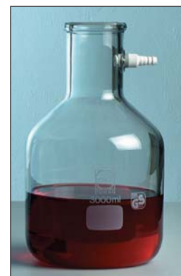
FK360-65 to -90