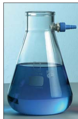
FK360-24 to -45