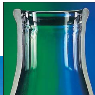
FK203, reinforced rim