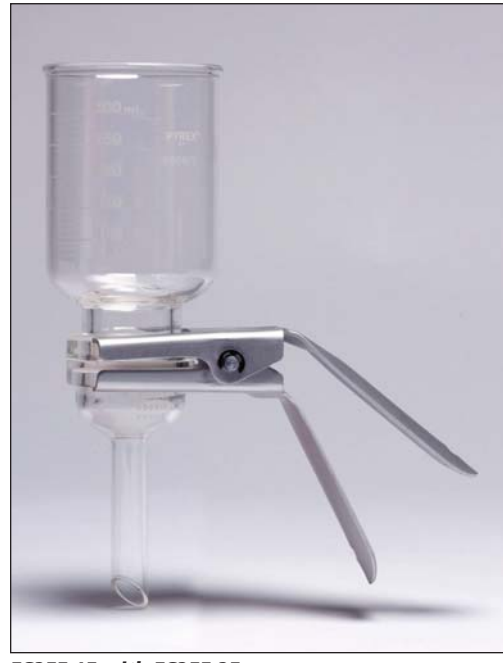
FC355-15 with FC355-35