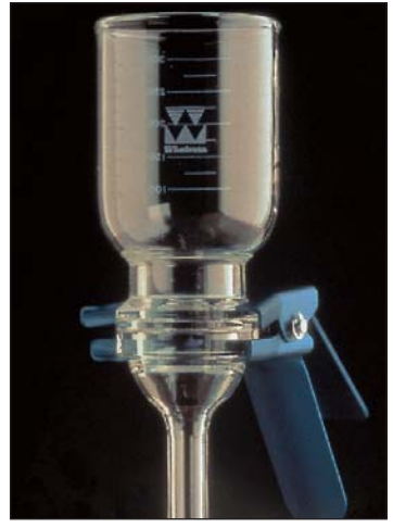
FC302, FC300 are similar

FC357-95 Complete filtration assembly, comprising 1 of each funnel, clip, base and flask