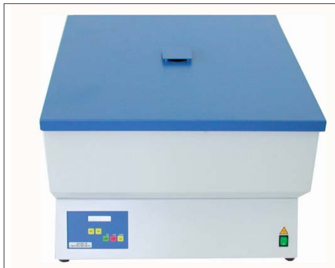
DA450-40, DA450-50 is similar