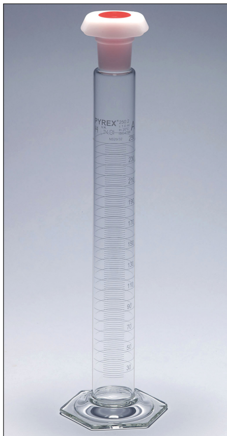
CY292, CY294 are similar

Provided the instrument is used with the recommended accessories and in accordance with the supplied instructions the manufacturer certifies conformity with annex 12 of the Eichordnung.