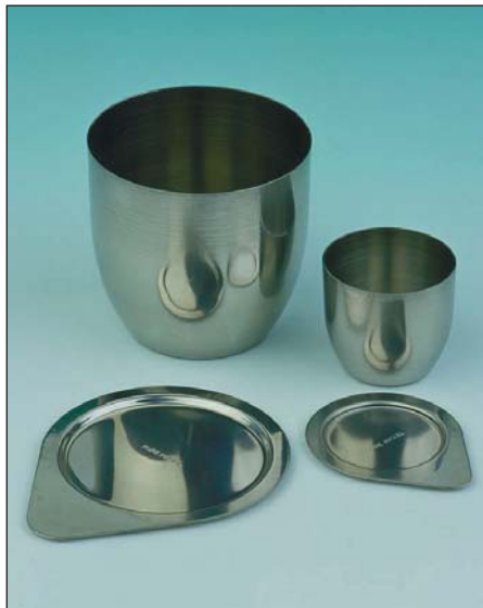
CX200 with CX202