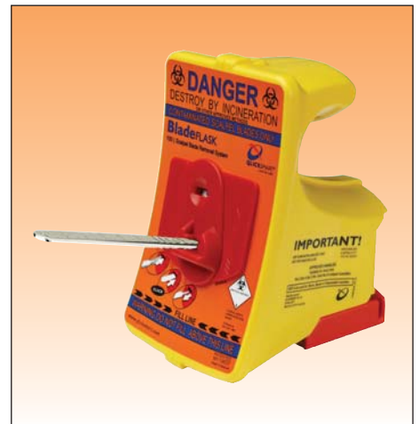
CM924-10 in use with CM924-12