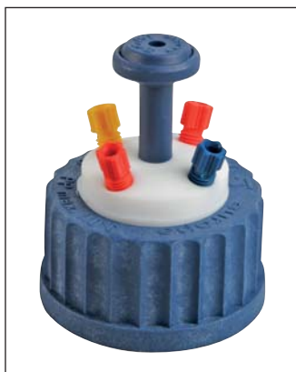
CK780-20, CK780-28 is similar