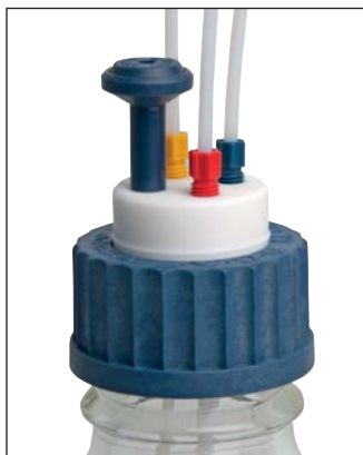
CK780-16 in use on bottle