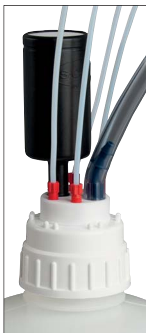
CK790-12 in use with CK794