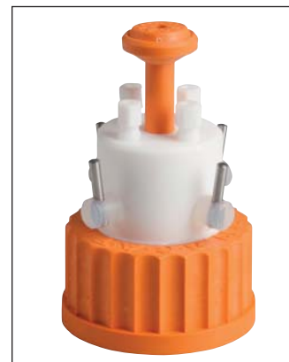
CK784-24, CK780-24 is similar