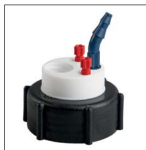
CK790-09, CK790-15 is similar