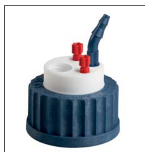
CK790-06, CK790-03 and CK790-07 are similar