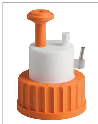
CK784-08, CK780-08 is similar