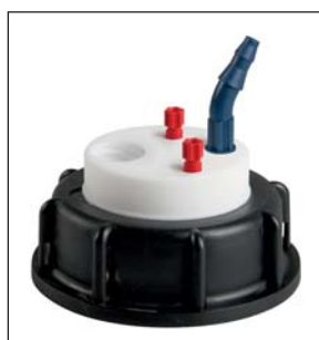
CK790-19 CK790-18 and CK790-26 are similar