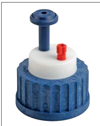
CK780-04, CK784-04 is similar