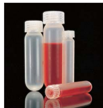
CF915, CF935 is similar