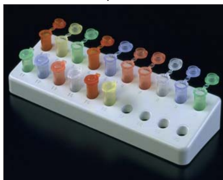
CF306-26 to CF306-29 in use with SM575