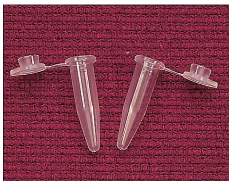
CF300-34, CF300-38 are similar

Thin-walled microtubes and PCR tubes – see Molecular Biology section .