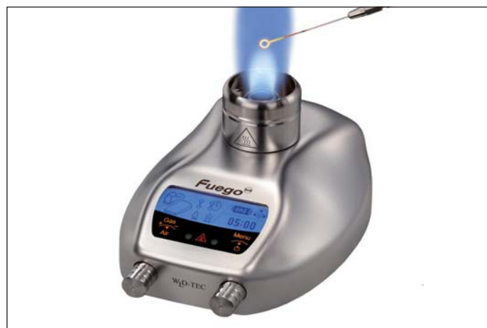
BY340-40 in use, BY340-30 is similar

Note: Gas cartridges BY344-27 can be exported only as sea freight – deck cargo. Local purchase is recommended.