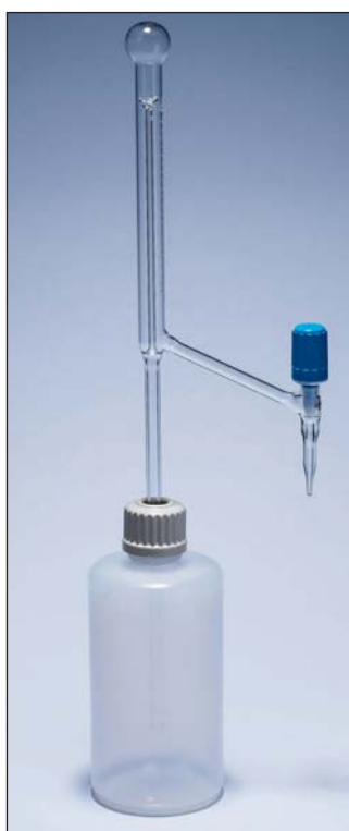
BW595 with BW597