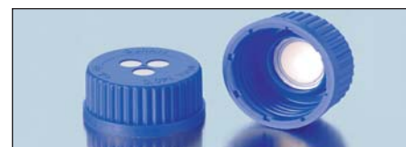
BS447-56, -58, -61