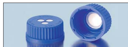
BS447-56, -58, -61