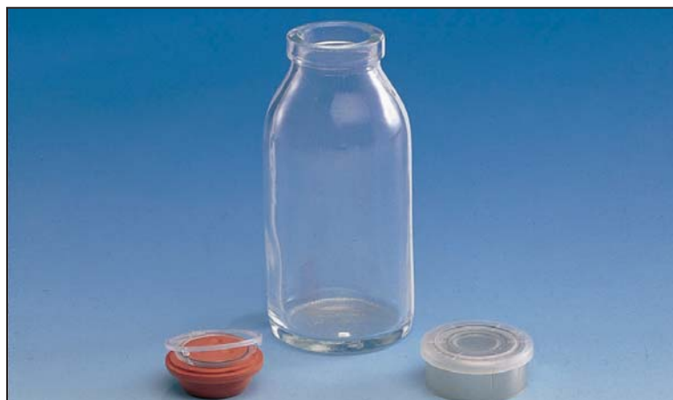
BR140 with BR142-06 and BR142-12