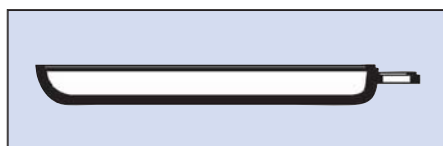
BP327, BP344 are similar