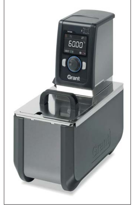
BJ180-49 in use on tank with lid