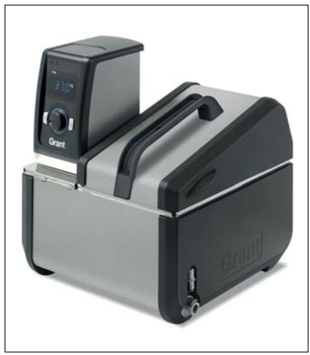
BJ180-18 in use on tank with lid