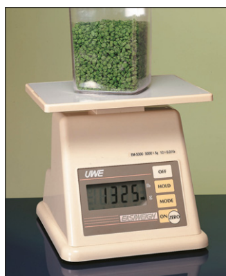
BA512-14 in use