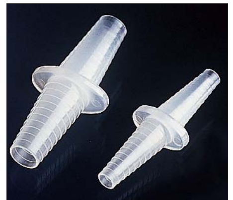
AD190-17 and -22